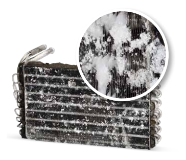
Without A/C maintenance