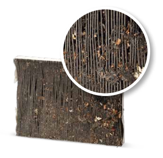
Without A/C maintenance